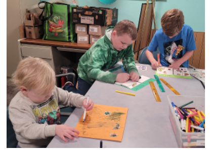
Little guests having fun at our monthly Just For Kids program!