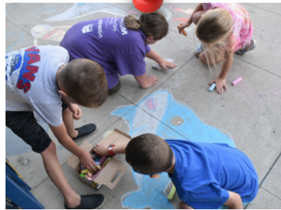
Summer Science Campers enjoying a day out drawing sharks with chalk!