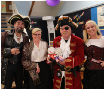
BVM volunteers at our Murder Mystery Event.