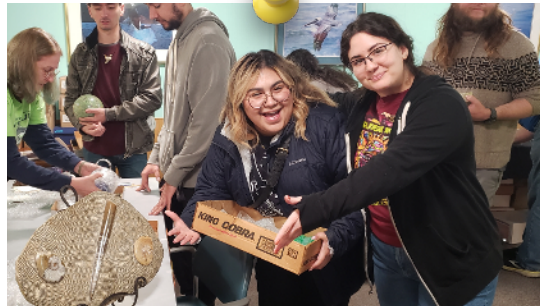
BVM guests and volunteers enjoying our annual Rock and Mineral Sale.